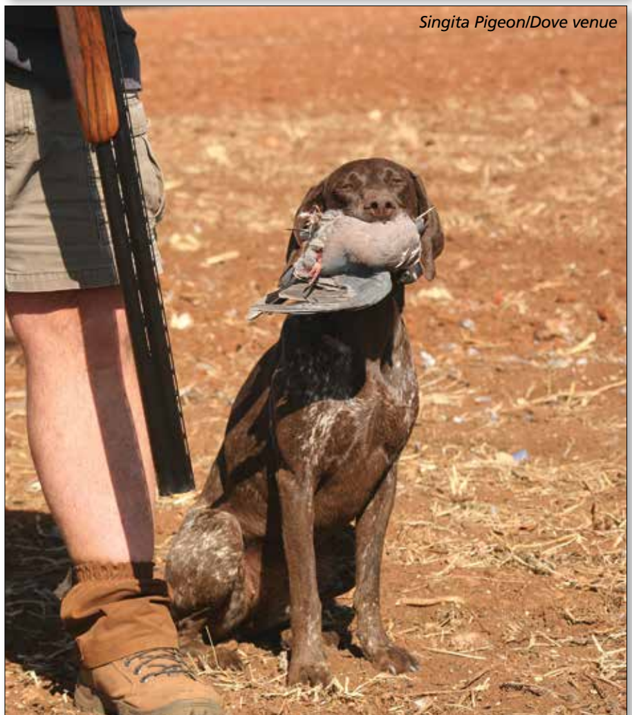
Singita Pigeon/Dove venue